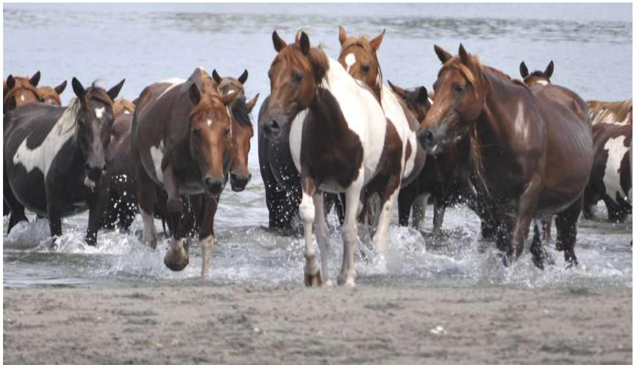
The ponies need no guidance to return to Assateague. They know the way, and are eager to return.