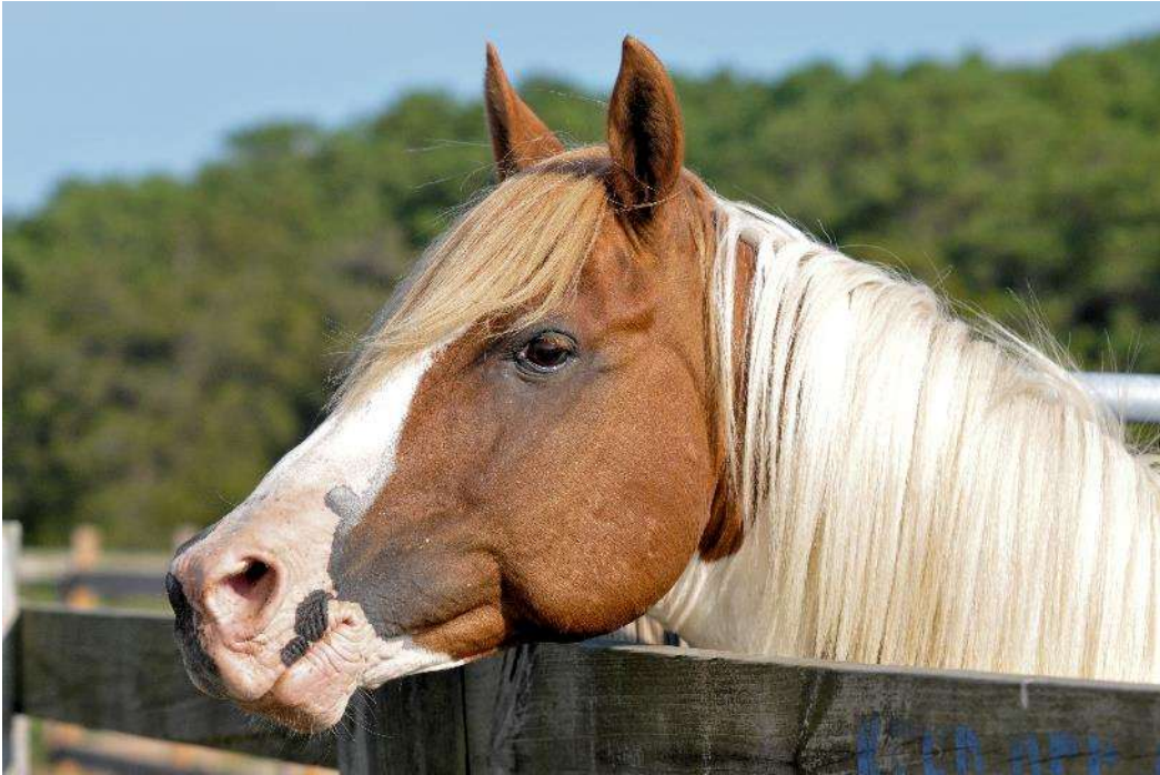
A pinto stallion surveys the competition on the other side of the fence. The corrals bring many stallions together in close contact, and they must posture and fight to maintain status and retain their mares.