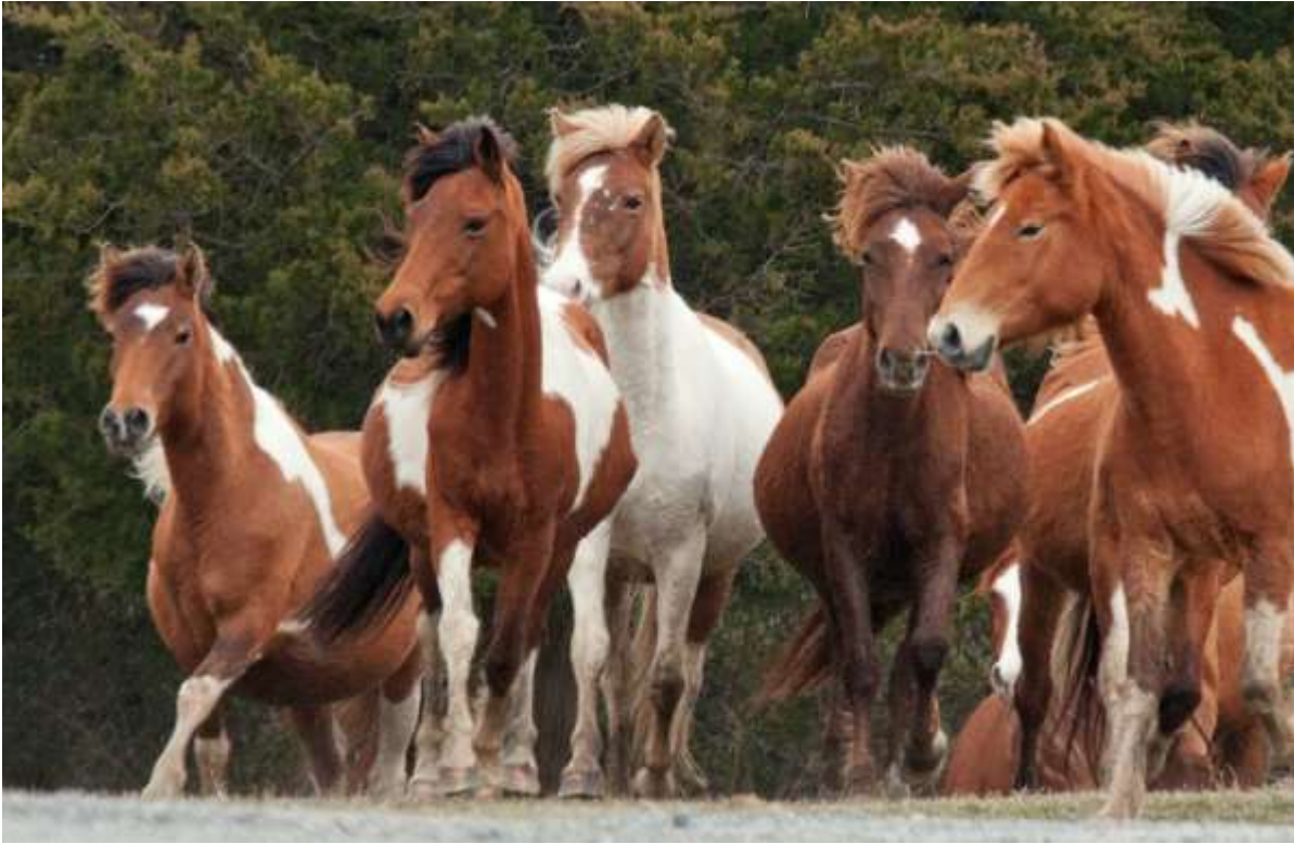
The Chincoteague Volunteer Fire Company gathers the ponies three times yearly to provide basic veterinary care, deworm them, and administer vaccinations. At the time of the April roundup, mares are just beginning to deliver that seasons foals.