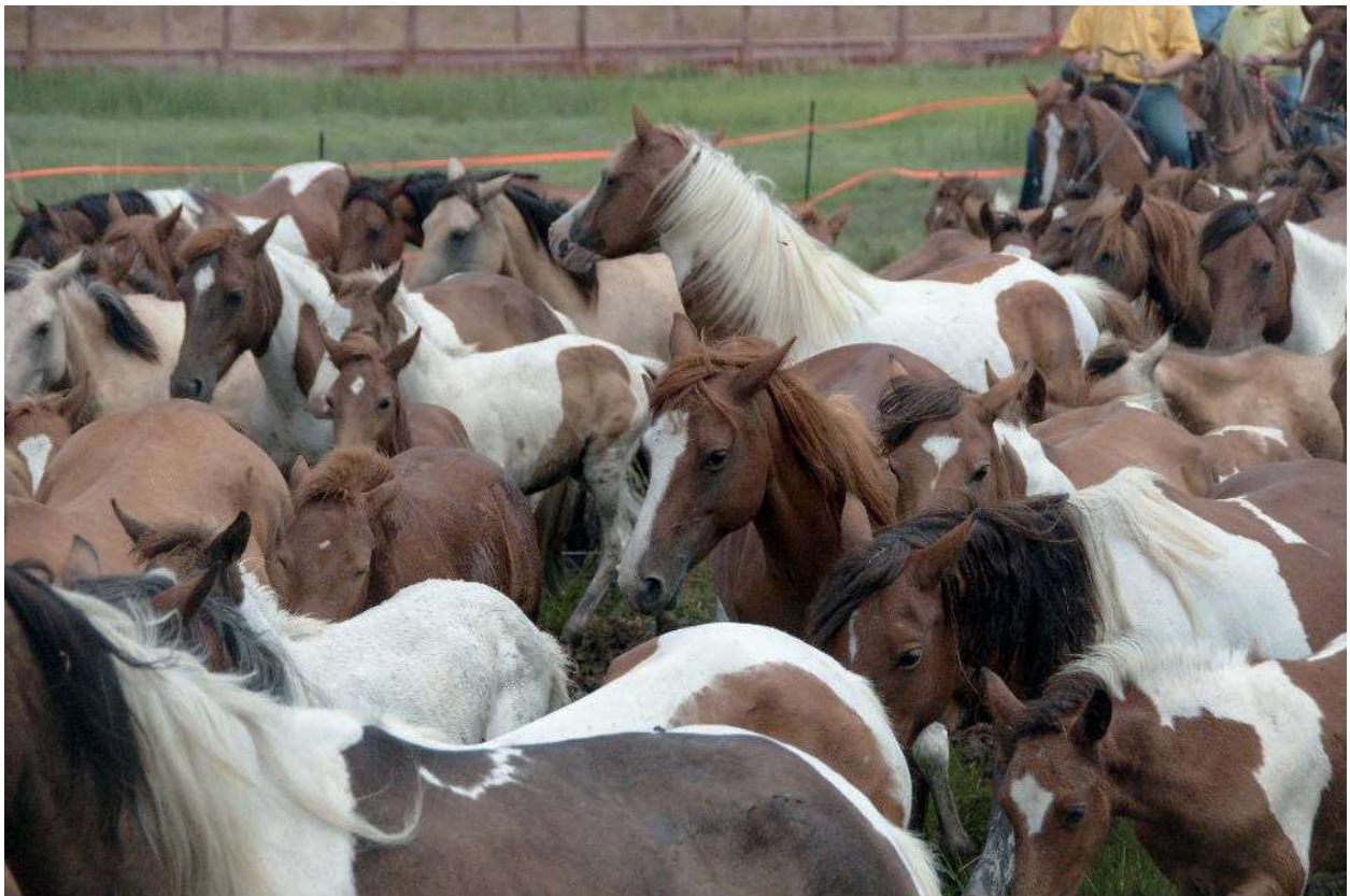
One hundred fifty adult ponies and their foals rush for the Fairgrounds in a cohesive mass.