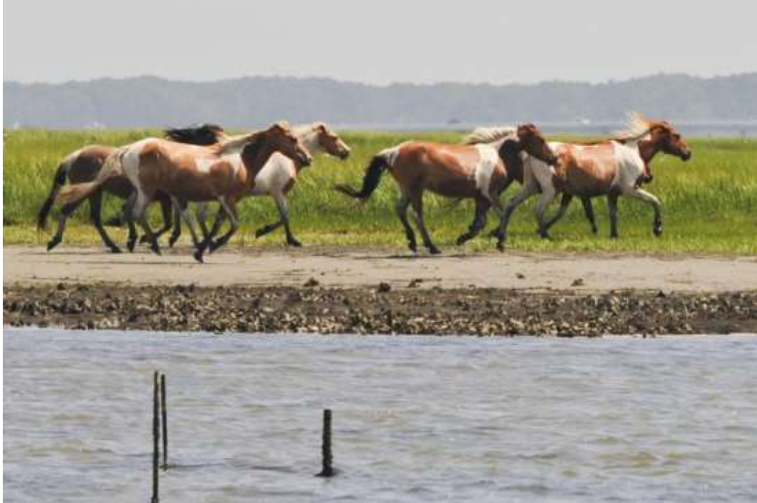
Overjoyed to return to their homeland, the south herd gallops along the water's edge.