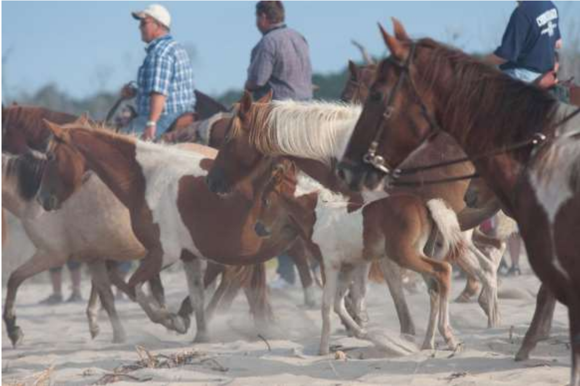
The Joining of the Herds is a well-attended event. Hundreds of people line up along the beach at dawn to watch the ponies arrive, kicking up sand and surf as they proceed down the beach.