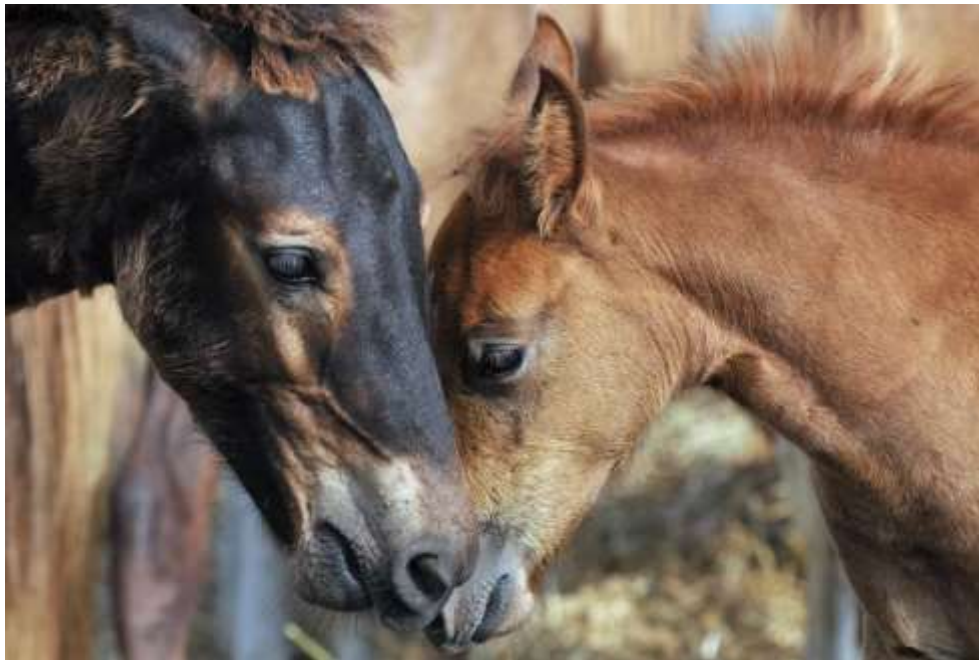
Young foals get acquainted in the Assateague corral. Like children, foals make new friends easily, and engage in games and races with other youngsters.