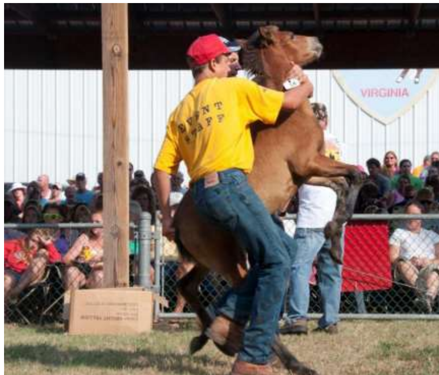
All of the foals are sold at auction to the highest bidders. Some will return to Assateague, but most will leave the island to find new lives as domestic horses.