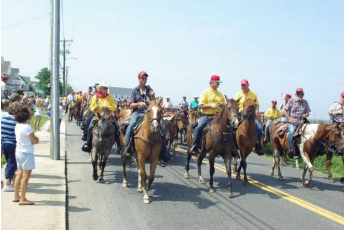
The Saltwater Cowboys surround the ponies and guide them to the fairgrounds, to the delight of onlookers.