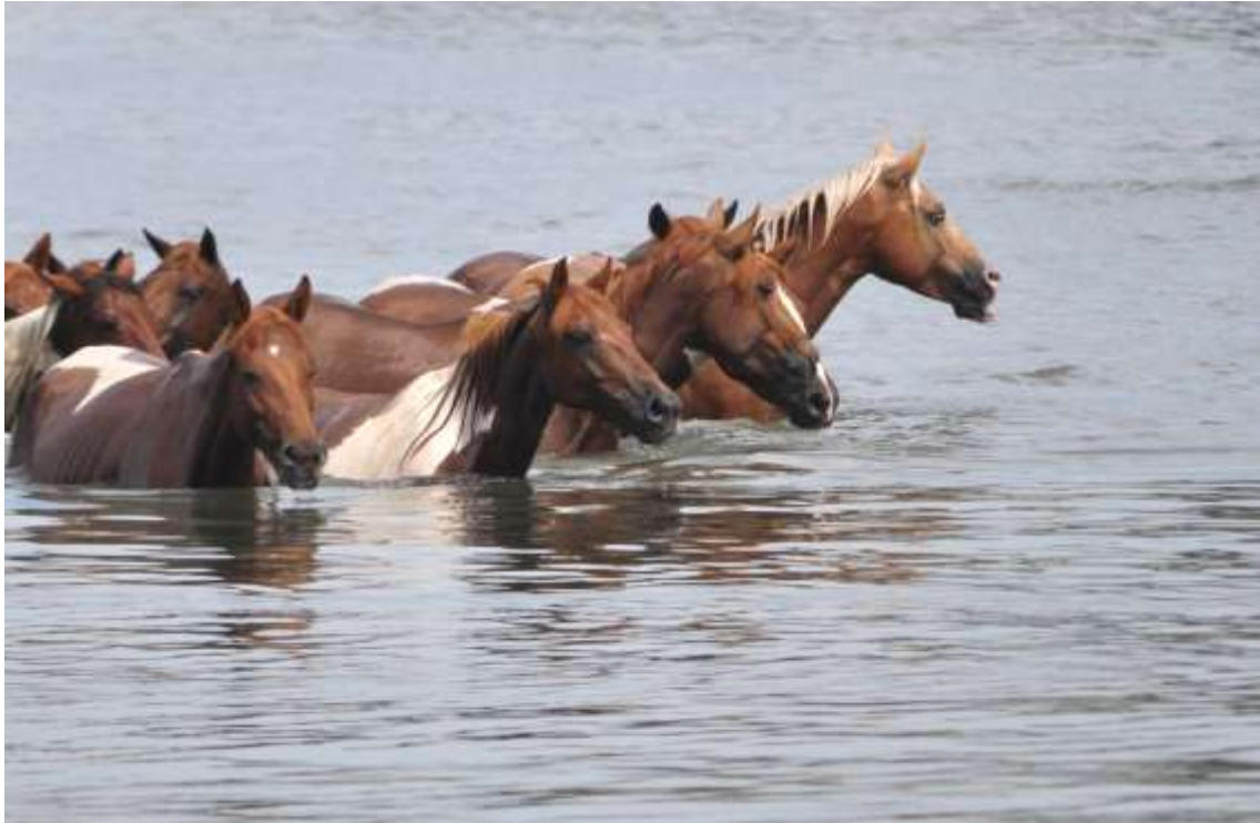
Ponies emerge from the water like mythical sea creatures.