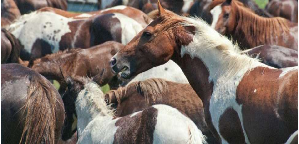
A stallion calls to his family as the Saltwater Cowboys gather the ponies for the annual parade down Main Street.