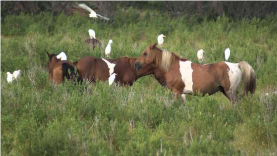
Cattle egrets feast on the invertebrates churned up by the feet of grazing ponies, and use the ponies for perches and roosts. The ponies do not seem to mind.