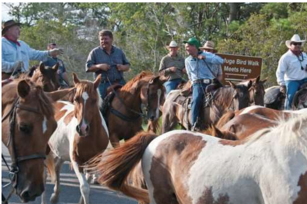
Salt Water cowboys laugh and joke among themselves as they chaperone the north herd of Chincoteague ponies to the corrals.