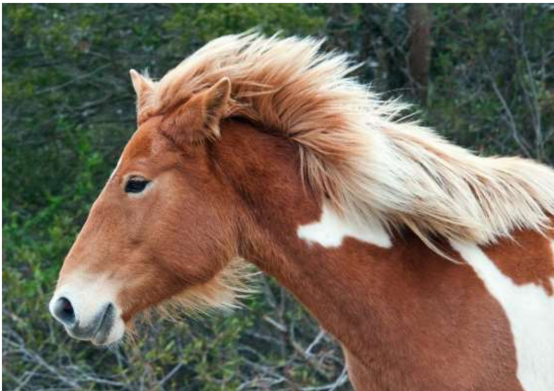
Chincoteague ponies are well insulated against the cold, stormy winters.